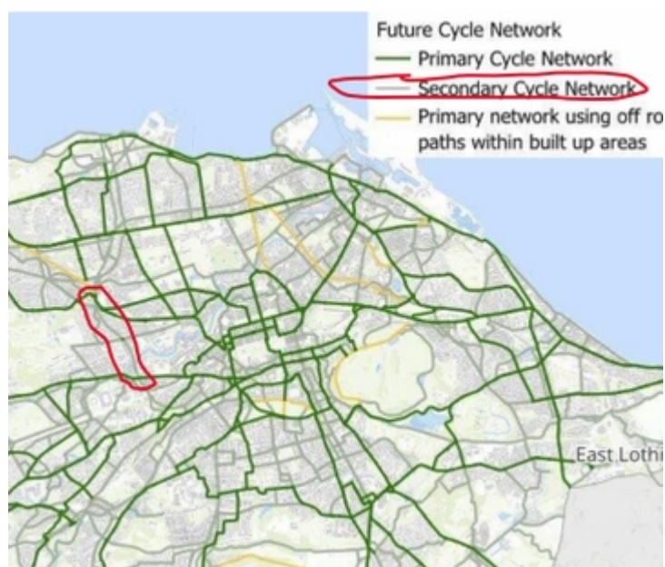
Map from fig 3.3 of the Circulation Plan report, TEC paper 7.2

11. Finally, the Future Streets Circulation Plan ( TEC report 7.2 ) rightly includes this route as part of the 'Secondary Cycle Network' (see map below) i.e. it is important for both utility and recreational purposes, and linking from the Primary Onroad Network. Councillors passing both reports unamended would be contradicting themselves and giving absurd instructions to officers – to discourage or even ban cycling on a route they have defined as part of the city's cycle network!