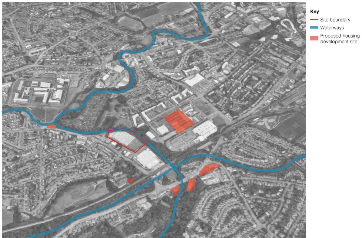
Image 2 - map showing all proposed local housing developments

Additionally, there is a major 'no car' development proposed on the other side of the Water of Leith to replace the 'World of Football' (1200 cycle parking provision).