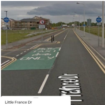
Little France Dr